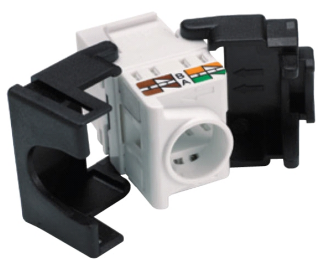
C. Rear view of Keystone with wire cap attached