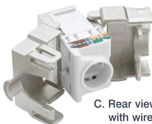
C. Rear view of Keystone with wire cap attached