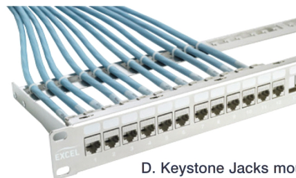
D. Keystone Jacks mounted in chrome style patch panel, Part No 100-028