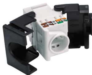
C. Rear view of Keystone with wire cap attached