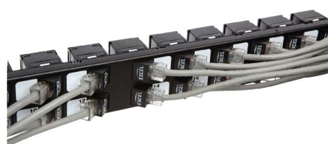
D. Keystone Jacks mounted in chrome style patch panel