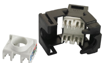
C. Rear view of Keystone with wire cap